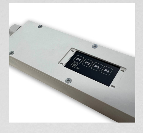
Smart and wireless electronics control for remote command