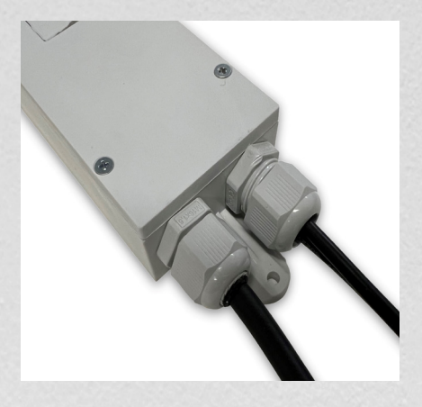
IP66 plastic box with wiring and customizable connectors