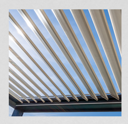
Ideal for management of 24Vdc linear motors for pergolas